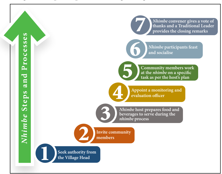
Figure 1: Steps and processes in organising nhimbe