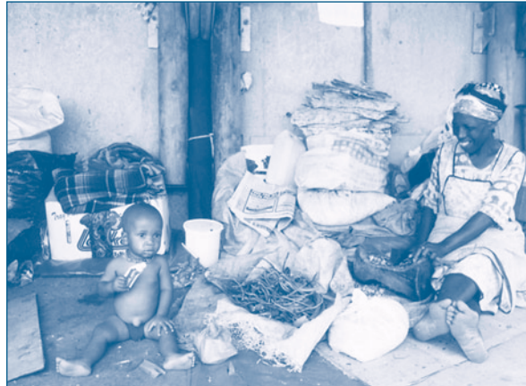
What we are talking about when we talk about care: a grandmother in Durban, working in a street market while looking after her grandchild.

The UNRISD study looked at aspects of the care economy in a number of countries and contexts. This is important because care crises exist in different contexts, among women with different experiences and situations. As such, there is no ‘one-size-fits-all’ approach. To demonstrate the different forms that care crises and solutions can take, speakers were invited to discuss their involvement in the UNRISD study and the country-specific findings from South Africa, South Korea and Switzerland. Two additional speakers were asked to reflect on the care crises in Central and Eastern Europe and the Middle East and North Africa (MENA) region.