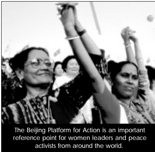
The Beijing Platform for Action is an important reference point for women leaders and peace activists from around the world.

The platform reiterates the need to protect women in situations of armed conflict in accordance with the principles of international human rights and humanitarian law, and recognizes women's roles in caring for their