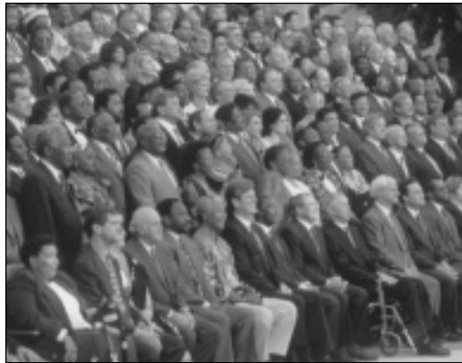
The adoption of positive action programmes in the new South Africa is widening the space for women to participate in charting the country's development.

Reflecting on events in Northern Ireland, Mo Mowlam suggests that through their decade of cross-community work, women there created space for moderation and compromise. "Attitudes, the hardest things to change in politics, slowly began to change," she says. In 1998, the Good Friday Agreement, which is the basis of the current peace process, was submitted for a public referendum. An