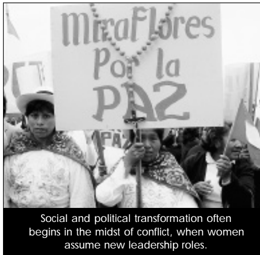
Social and political transformation often begins in the midst of conflict, when women assume new leadership roles.

The chaos of conflict sometimes sweeps aside traditional structures and norms, bringing women into the public sphere. This can occur regardless of whether there